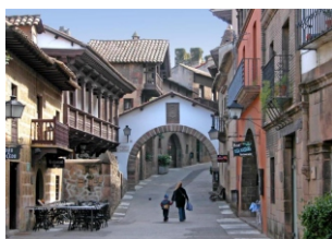
"El Poble Español", Barcelona