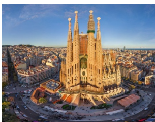
Sagrada Familia, Barcelona