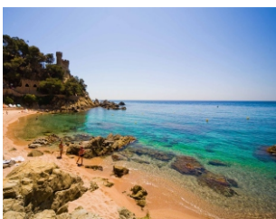
Lloret de Mar, Barcelona