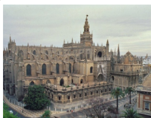
Cathedral of Seville

Suitable all year round and for all group categories (families, friends, couples, corporate travel...)