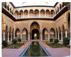
Royal Alcazar Palace, Seville