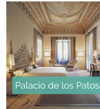
Palacio de los Patos

AC Palacio de Santa Paula is housed between a former 14th-century Casa Morisca and a 16th-century Convent.