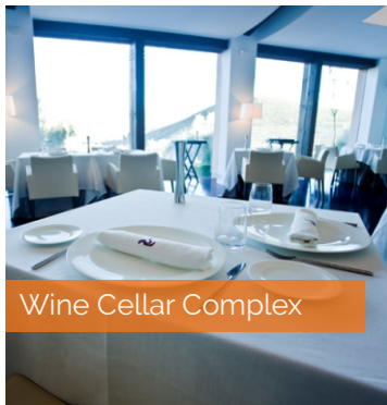
Wine Cellar Complex