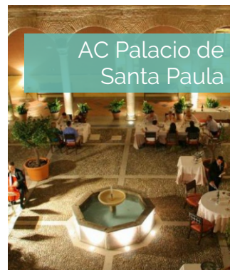
AC Palacio de Santa Paula