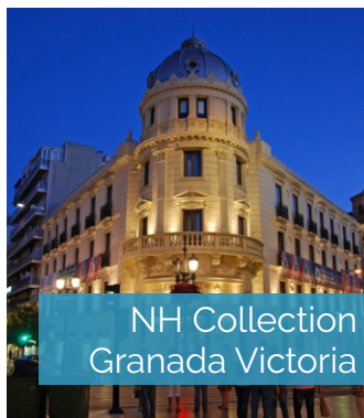
NH Collection Granada Victoria

Set around a traditional Andalusian-style courtyard 4* Hotel Vincci Albayzín features air-conditioned rooms with free Wi-Fi. It has a fitness center including a sauna.